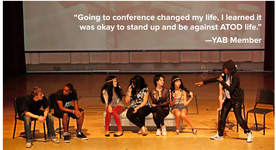
Figure 1. Change in Leadership with Others

In the end, by utilizing key prevention principles such as having youth-led programs, providing opportunities for youth to interact with other pro-social youth, and insisting upon a "no use" message, Y2Y is contributing in meaningful ways to preventing substance use and abuse among teens. For more information on these findings, please read the entire report available at: cayci.osu.edu .